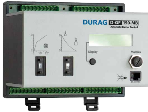
D-GF 150 MB